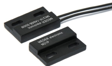
Detection of the door and window position