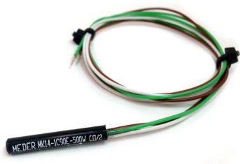
Reed Switch based cylindrical proximity sensor