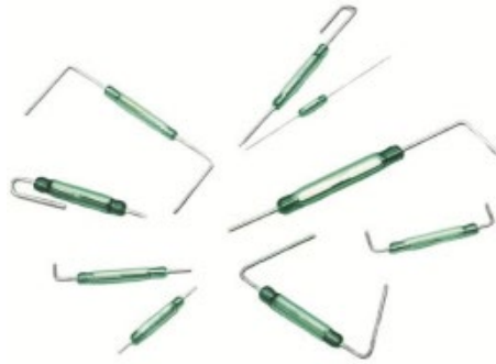
Reed Switch variations