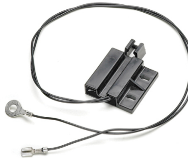
Custom Safety shutoff Switch and magnet assembly