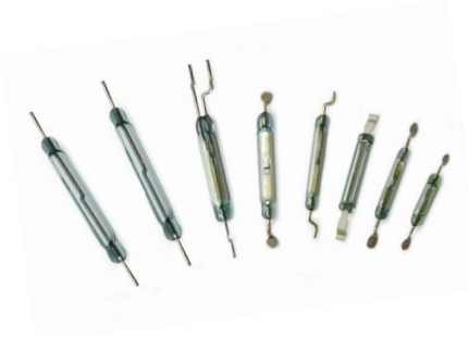
Open reed switch for SMD mounting with flat or round connections: