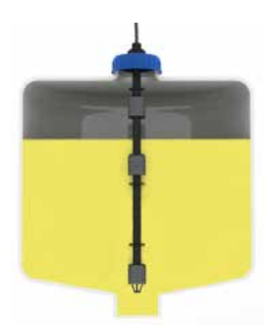
Figure 1. A triple float sensor connected to the top part of a container

Liquid systems all have their own specialty aspects and their own peculiarities. The liquids vary in density and viscosity (flow level) in going from water with a centi-poise of 1 to liquid epoxies having up to 10,000 centi-poise. Also, the temperatures can vary from -40°C for flour-inert (3-M liquids) to 200°C for pressure heated water and other special liquids. Meeting these extremes is no easy matter. Standex's new LS04 series attacks these extremes along with multiple sensing points and multiple floats. Therefore, liquid baths having two or more different liquids with different densities and viscosities can be simultaneously measured and their liquid levels monitored.