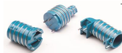
Tire Pressure monitoring antennas