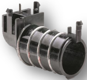
Custom insert molded antenna coil