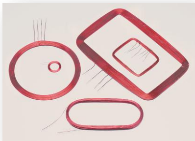
Custom air wound antenna coils