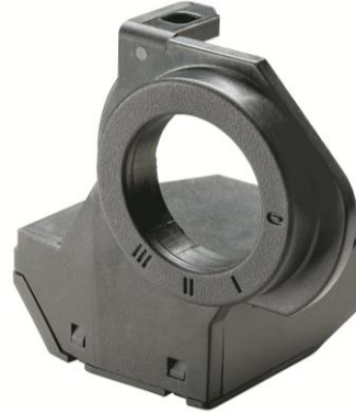
Auto immobilizer antenna receiver molded into custom packaging